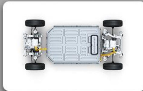
High Plus electronic stability system