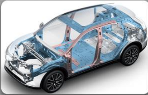
76.2% high strength steel