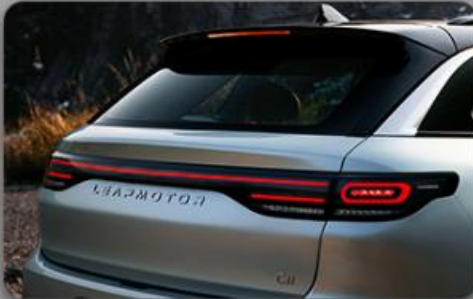
Transverse integrated taillights